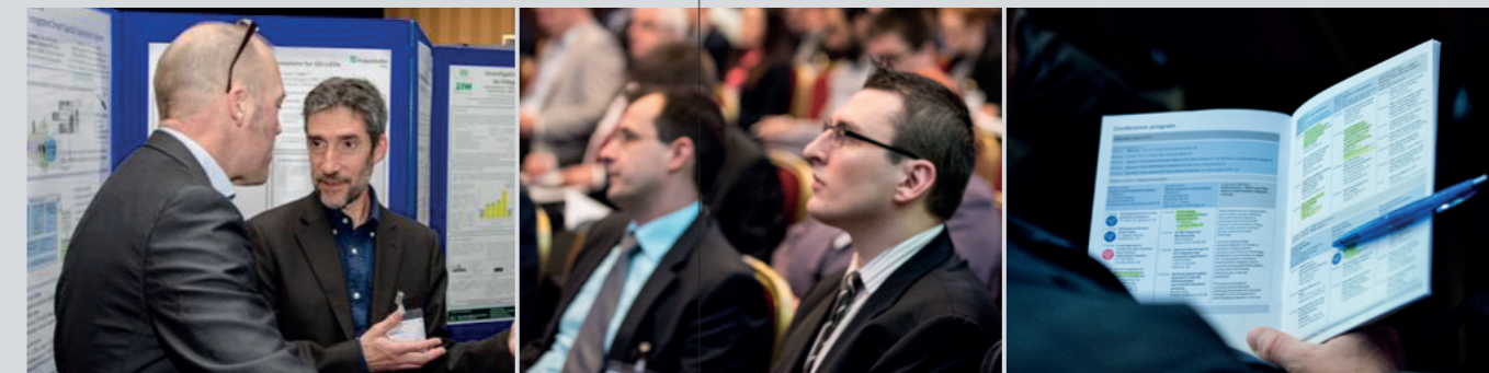
Impressions of SSI 2017 Exhibition and conference in Cork, Ireland

Submission no later than 5 October 2017 at smartsystemintegration.com/callforpapers